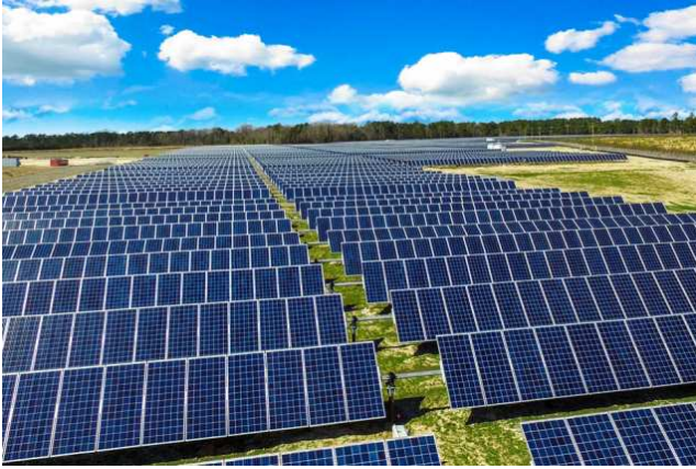
Figure 1. Example of solar energy [3].

there are certain disadvantages. Solar concentrators can alter the properties of the Earth and change its plants. The growth of the solar cells' air, the air is associated with the reflection of the Sun's light. This phenomenon can change the humidity, heat balance and direction of the wind. Low-temperature boiling fluids in solar panels can be exposed to drinking water after a long period of use.